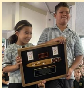
St Martin's School Students