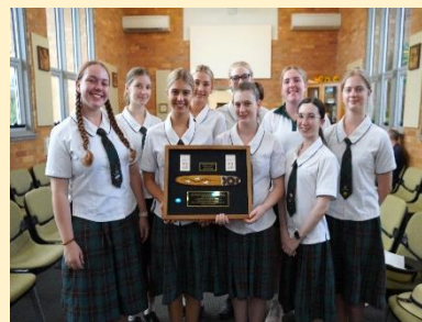
San Sisto College Students