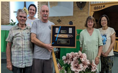
Parish Social Justice Group

The journey of the Message Stick is designed to herald the 150th Anniversary of the completion and opening of the Cathedral of St Stephen on the sacred lands of the First Nations Peoples of Meanjin Brisbane. The Message Stick holds an invitation for parishioners across the Archdiocese to come together on Pentecost Sunday, 2024, at the Cathedral to celebrate this momentous occasion.